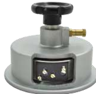
Optional Fabric Cutter To be used with g/m 2 program